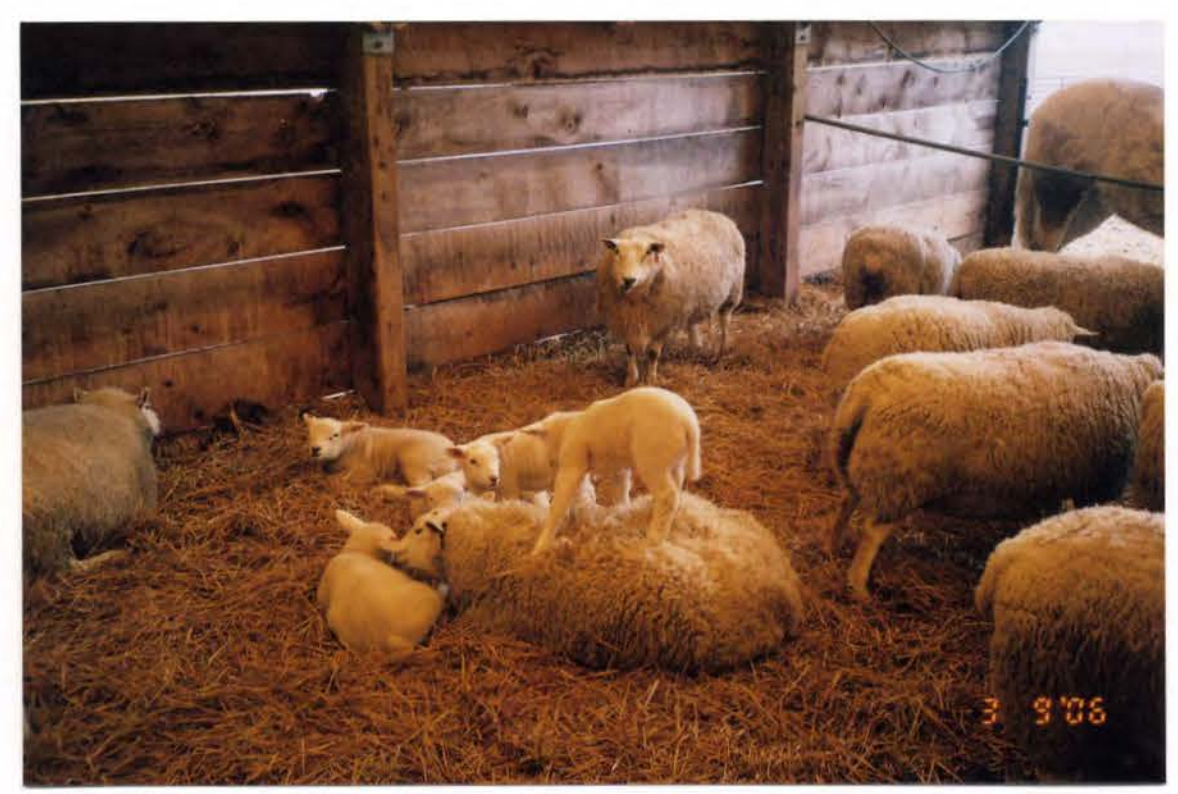
Tescal Sheep & Lambs.